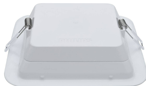
LED recessed downlights square LEDINARE DN065B G2 11W 900lm - Philips 4000k