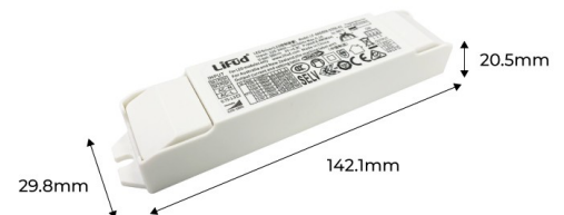
Driver DALI-2 DT6 LIFUD