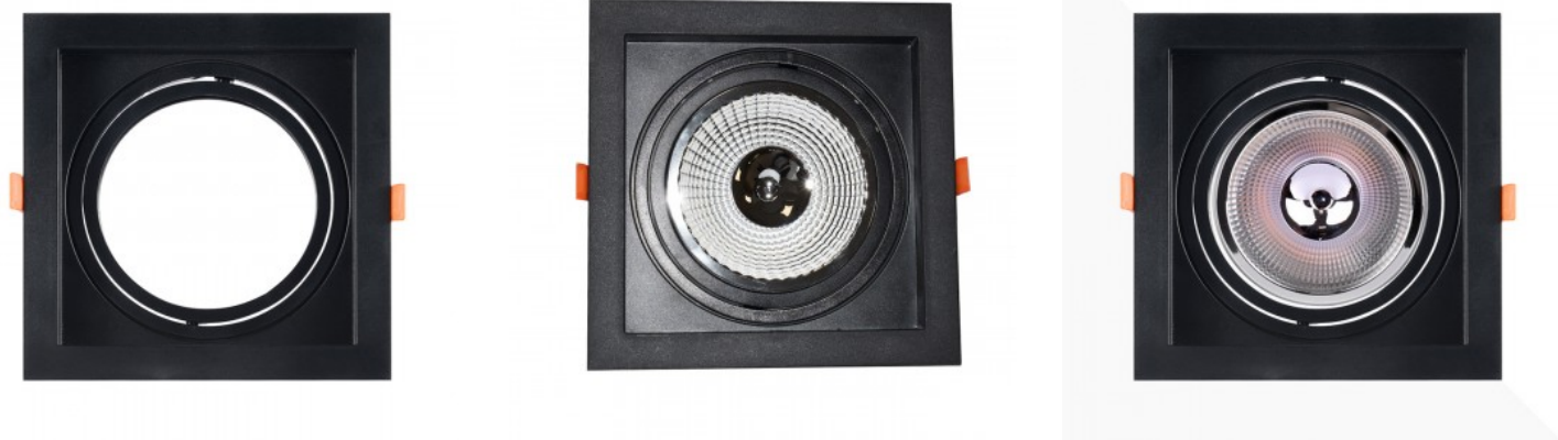
Square cardan type downlight ring for QR111 or AR111 bulb - Cutting 155 x 155 mm