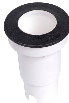
CCT FUMAGALLI CECI 90 GU10 3.5W recessed LED ground beacon CCT FUMAGALLI CECI 90 GU10 3.5W