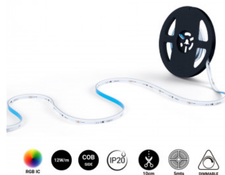
COB RGB Smart LED Strip - 24V DC - Side emission - 12W/m - 10mm - IP20 - 5 metres roll