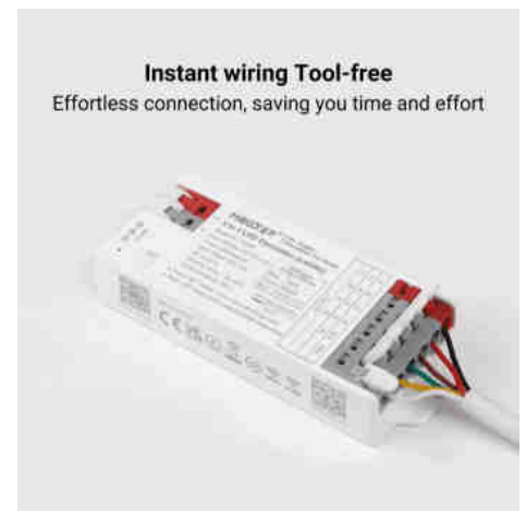
LED Strip Controller 3 in 1- RGB / RGBW / RGB + CCT - 12/24V DC - 2.4GHz - Mi Boxer - E3-RF