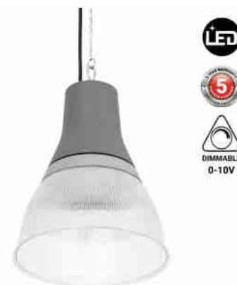
Commercial LED High Bay - CCT - (25W / 40W / 60W / 80W) - Polycarbonate Diffuser - UGR19 - Lifud Driver